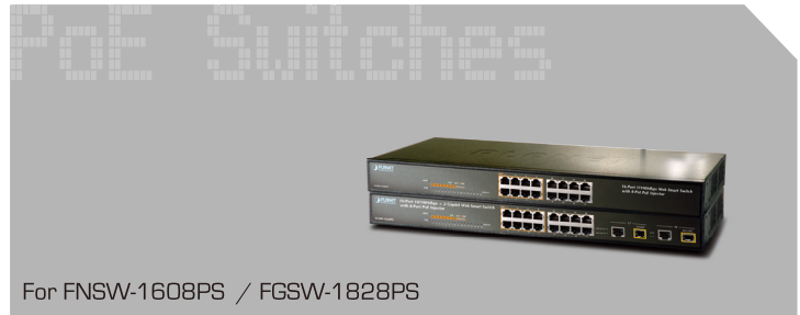
For FNSW-1608PS / FGSW-1828PS