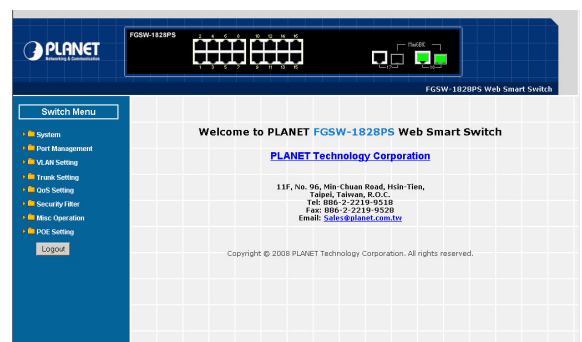
Figure 2. Web Main Screen of FGSW-1828PS

After entering the username and password (default user name and password is "admin") in login screen (Figure 1 appears). The Web main screen appears as Figure 2.