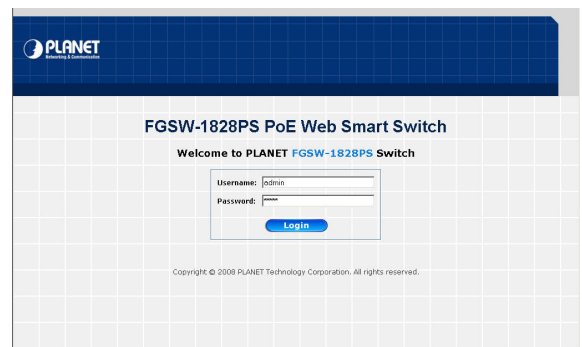
Figure 1. Web Login Screen of FGSW-1828PS

After entering the username and password (default user name and password is "admin") in login screen (Figure 1 appears). The Web main screen appears as Figure 2.