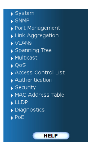
Figure 6-4 Switch Menu

4. The Switch Menu on the left of the Web page let you access all the commands and statistics that Managed Switch provides.