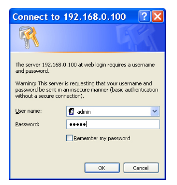
Figure 6-2 Login Screen

Default User name: admin Default Password: admin