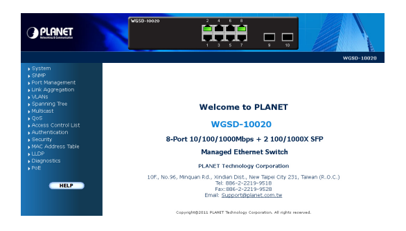
Figure 6-3 Web Main Screen of WGSD Managed Switch

3. After entering the password, the main screen appears as Figure 6-3.