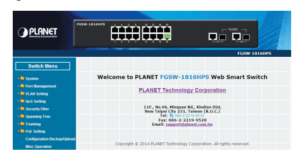
Figure 3-3: Web Main Screen of Web Smart PoE Switch

3. After entering the password, the main screen appears as Figure 3-3 shows.