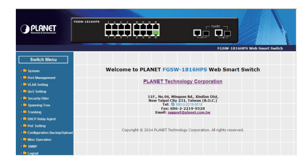
Figure 3-3: Web Main Screen of Web Smart PoE Switch

3. After entering the password, the main screen appears as Figure 3-3 shows.