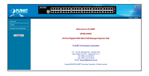
Figure 3-3: Web Main Screen of Ultra PoE Managed Injector Hub

The following web screen is based on the UPOE-2400G. The display of the UPOE-800G and UPOE-1600G is the same as that of the UPOE-2400G.