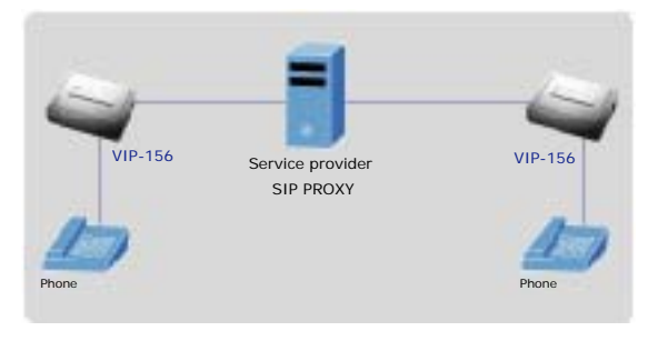
VIP-156 communications via SIP proxy (Service provider solution)