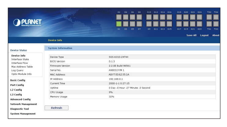
Figure 5-3: Web Main Screen of Managed Switch

3. After entering the password, the main screen appears as shown in Figure 5-3.