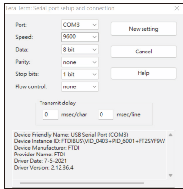
Figure 4-2: Tera Term COM Port Configuration