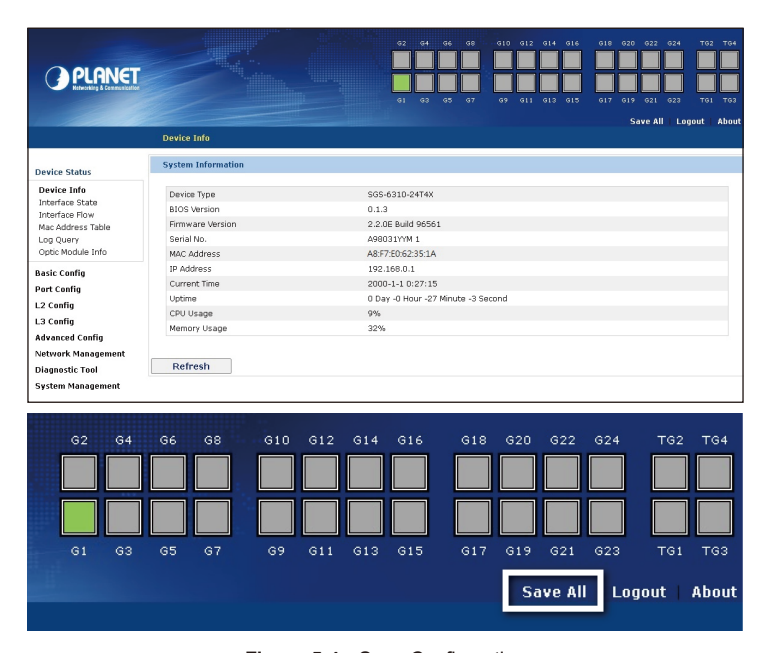
Figure 5-4: Save Configuration

To save the configuration, you have to click "Save All" on the top control bar. "Save All" function is equivalent to the execution of the write command.