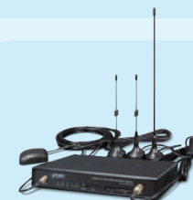
Vehicle 4G LTE Cellular Wireless Gateway VCG-1500WG-LTE