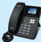
HD Color PoE IP Phone VIP-1120PT