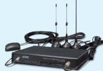
EN50155 4G LTE/GPS/ Wi-Fi Gateway VCG-1500WG-LTE