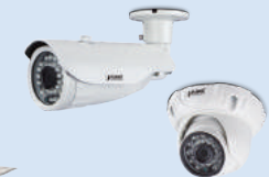
H.265 1080p IR Bullet/ Dome PoE IP Camera ICA-3250/ICA-4250