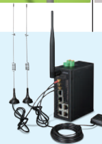
Industrial 4G LTE/GPS Gateway ICG-2510WG-LTE