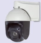
2 Mega-pixel IR PoE Plus Speed Dome IP Camera with Extended Support ICA-E6265