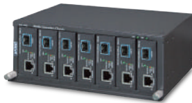
Media Chassis Installation