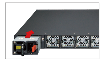
Figure 3-2 Sliding the Power Supply Unit into the Compartment

2. Install the redundant power supply unit by sliding it into the compartment.