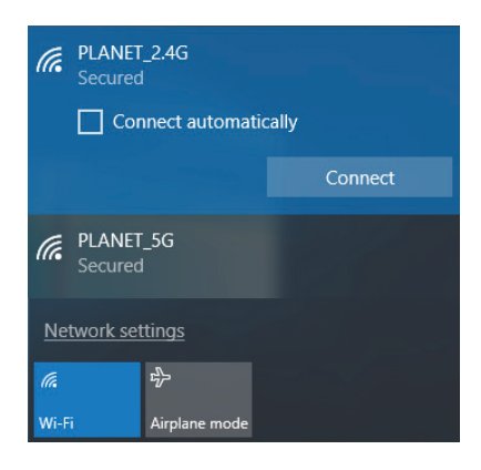
Step 3: Enter the encryption key of the WDAP-1800AX if necessary.

Step 2: Highlight the wireless network (SSID) to connect and click the [Connect] button.