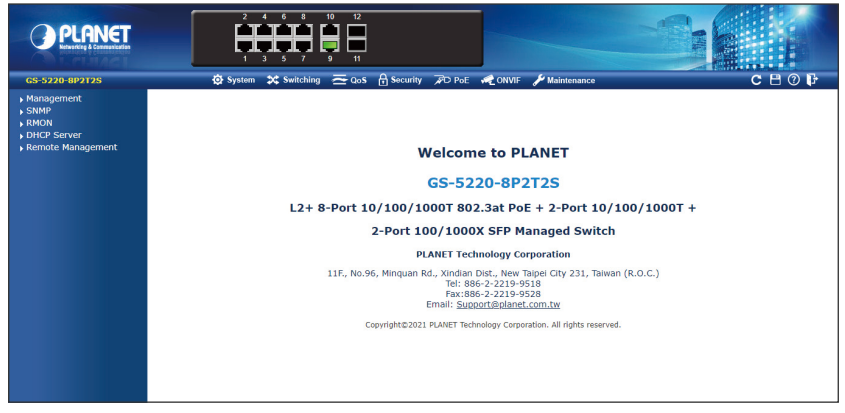
Figure 4-3: Web Main Screen of L2+ Managed PoE+ Switch

3. After entering the password, the main screen appears as Figure 4-3 shows.